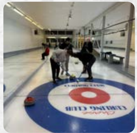
CURLING AT THE CHASE CURLING CLUB