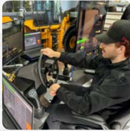
HEAVY EQUIPMENT SIMULATOR AT ROAD BUILDERS ROADSHOW