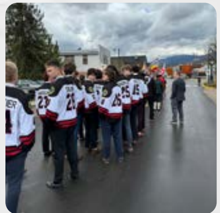
REMEMBRANCE DAY MARCH & CEREMONY