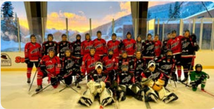
TEAM TRIP TO SUN PEAKS RESORT