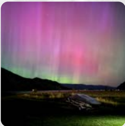
NORTHERN LIGHTS OVER THE LAKE