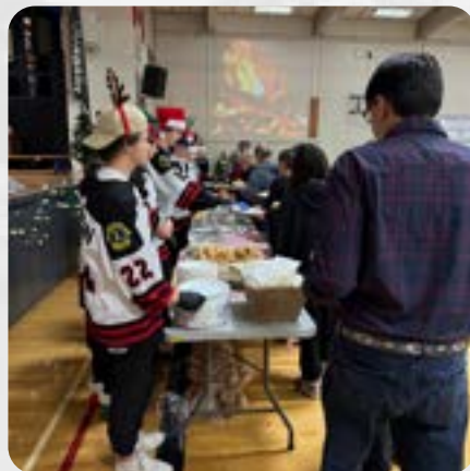
HELPING AT THE C.S.S CHRISTMAS LUNCH